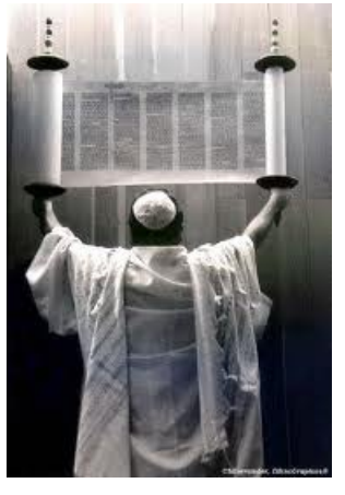
Shavuot May 27th